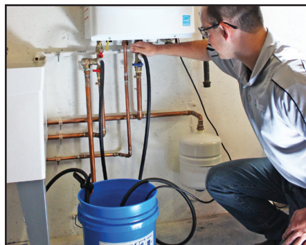
5. FLUSH UNIT, DISCONNECT HOSES & RETURN UNIT TO SERVICE.