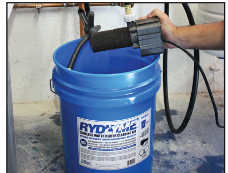
4. PLACE PUMP INSIDE BUCKET, TURN ON PUMP & CIRCULATE.