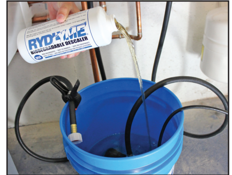
2. POUR RYDLYME & WATER INTO THE 5 GALLON RTK BUCKET.