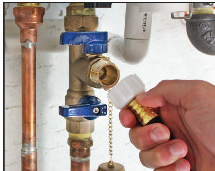
3. CONNECT HOSES TO APPROPRIATE HOT & COLD SERVICE VALVES.