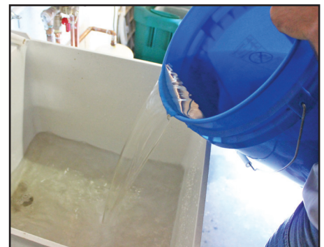
6. DISPOSE SOLUTION DOWN NORMAL DRAIN OR SEWER.

For complete RTK cleaning procedures or more information, please visit our website at www.apexengineeringproducts.com .