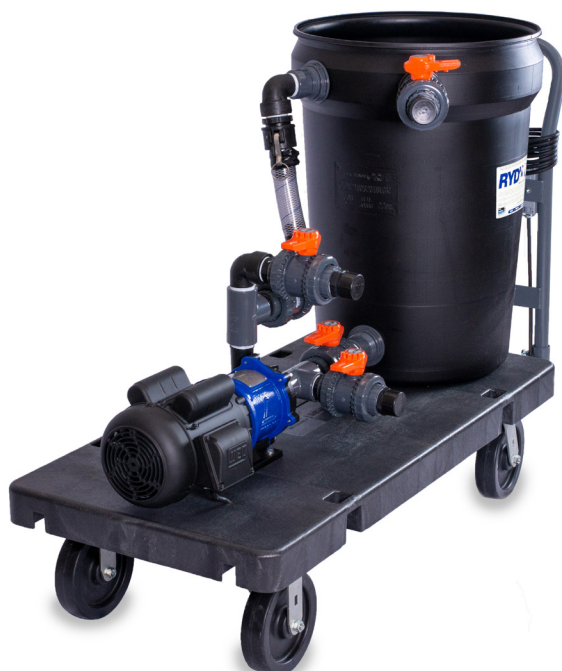
Industrial Descaling System 15MDC

Certified to NSF/ANSI 60 Nonfood Compounds (A3)