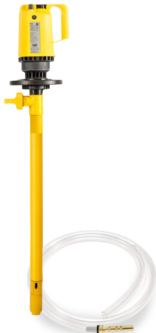
Industrial Descaling System 75LDP