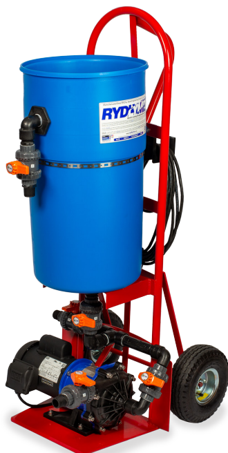
Industrial Descaling System 10CIP