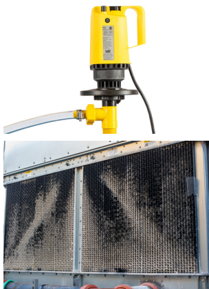
Industrial Descaling System 75LDP

Certified to NSF/ANSI 60 Nonfood Compounds (A3)